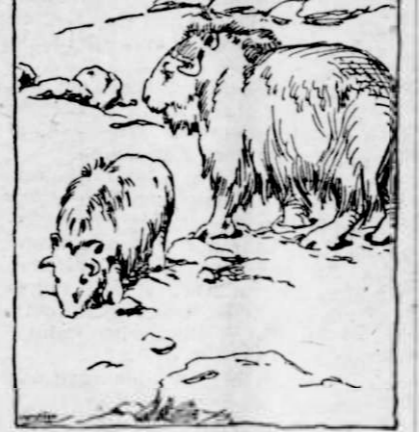
"My Only Child."

MUSK-OX WAYS "Listen to me, my child," said Mother Musk-Ox, "and I will tell you of the family ways..."